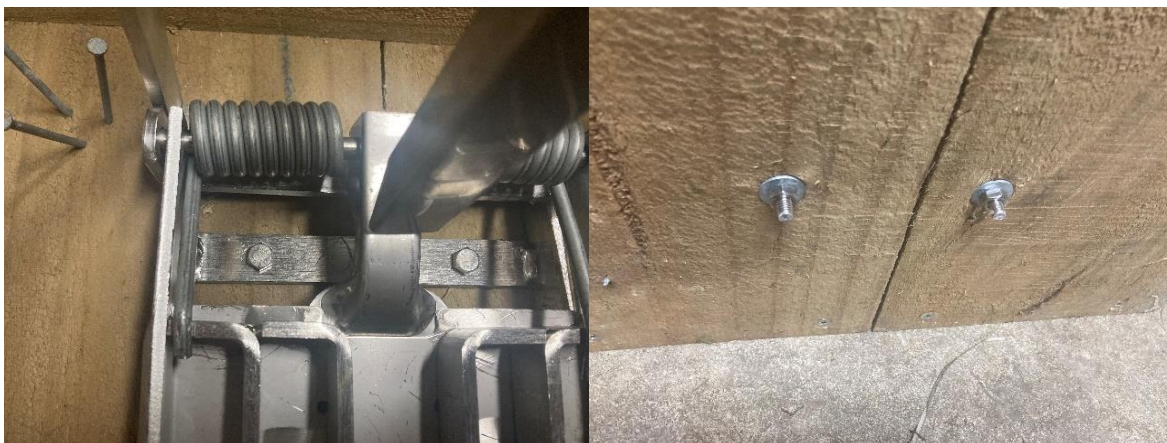
Figure 2. For test 2 the modified trap was bolted into the tunnel base (left) with a washer and nut assembly, securing the bolts on the underside (right). A setting tool was used to set the trap.

The spring strength of the trap was increased to increase the impact momentum of the kill bars. To achieve this, the diameter of the spring wire was increased from 5.0 mm to 5.3 mm, which increased impact momentum by 27% (Mike Baird, National Springs & Wire Products NZ Ltd, pers. comm., July 2021). Because of the extra force required to set the trap it was bolted into the trap tunnel (Figure 2) and a setting tool was used to set the trap. 4